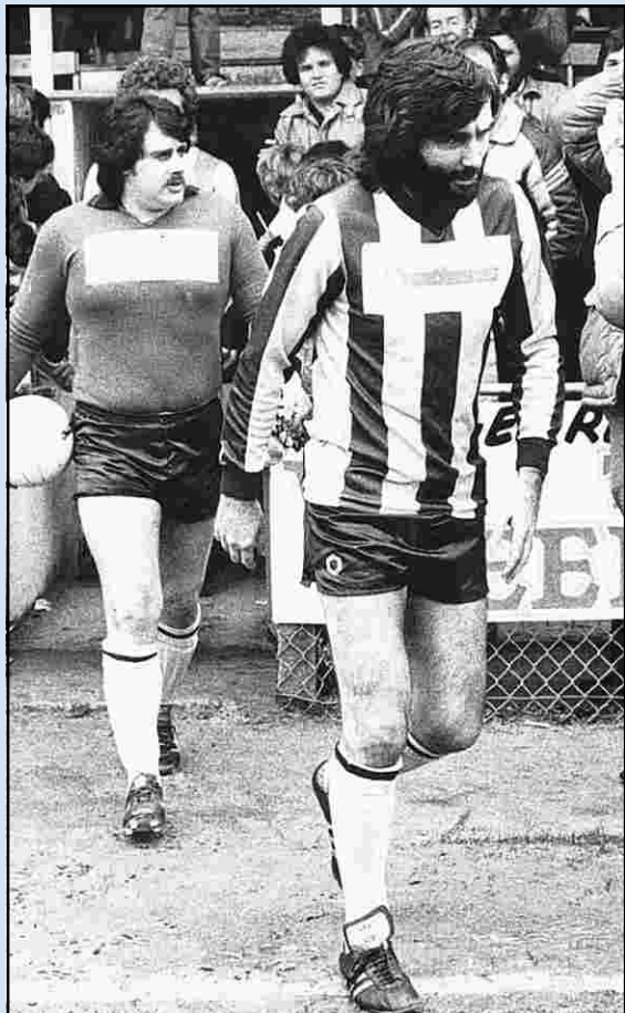
■ GEORGE BEST: At Plainmoor in 1983